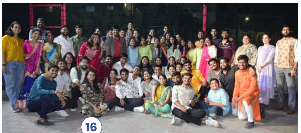
DANDIYA CELEBRATION ▶