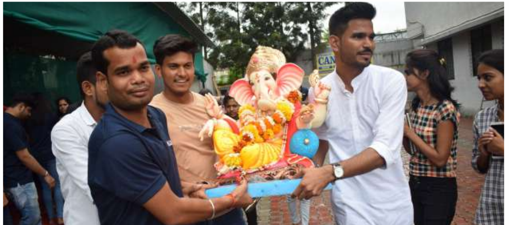
GANESH CHATURTHI ▶ CELEBRATION