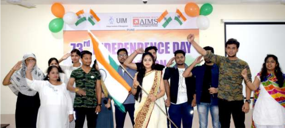
◀ INDEPENDENCE DAY CELEBRATION