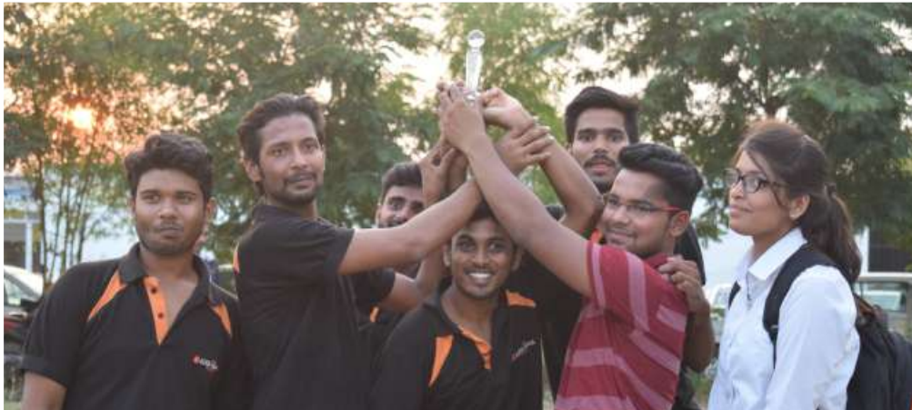
◀ SPORTS COMPETITION