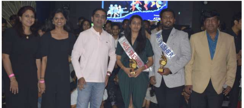
MR. & MS. FRESHER'S ▶