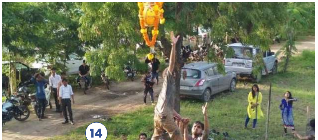
DAHI HANDI ▶ CELEBRATION